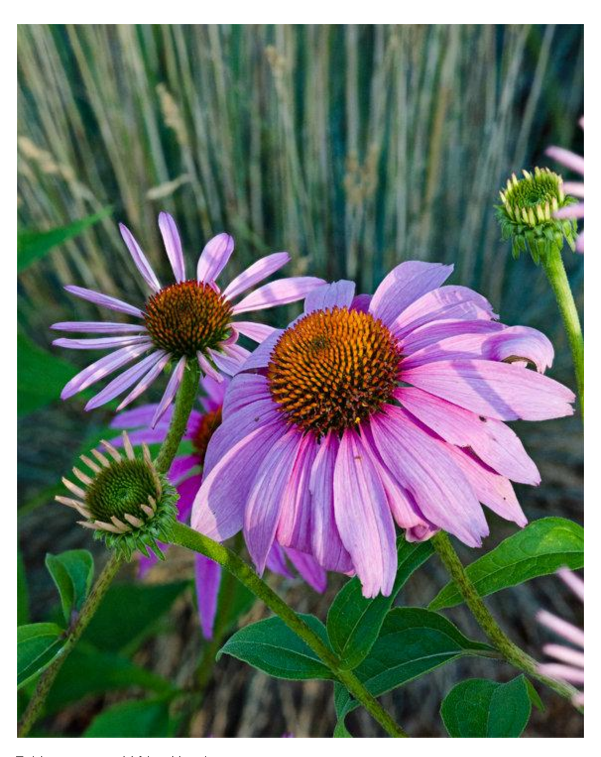
Echinacea, my old friend in winter.