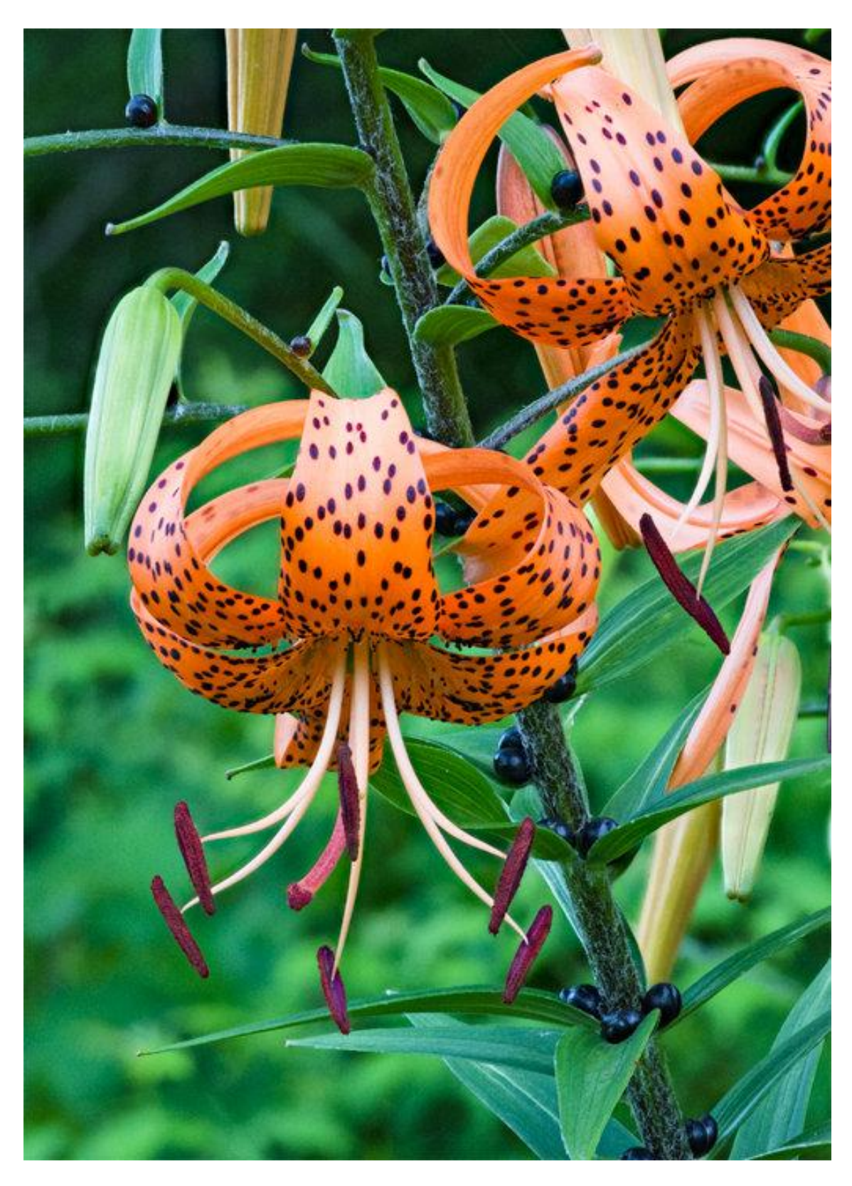
The glorious Tiger Lily.