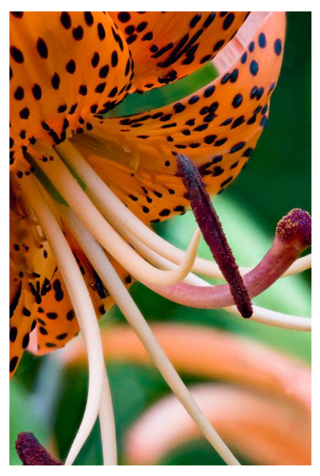
Tiger Lily, what a gorgeous flower!